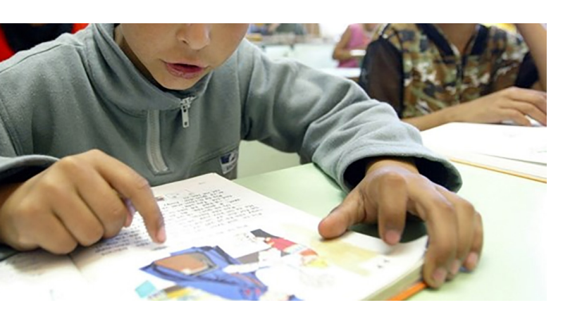
Roma children are the most affected by segregation in schools.

"States Parties shall respect and ensure the rights set forth in the present Convention to each child within their jurisdiction without discrimination of any kind, irrespective of the child's or his or her parent's or legal guardian's race, colour, sex, language, religion, political or other opinion, national, ethnic or social origin, property, disability, birth or other status." (extract from the UNCRC)